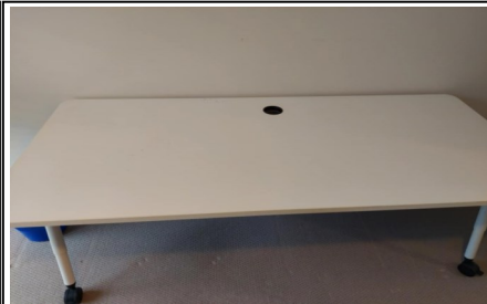
Student Table On Wheels $20.00