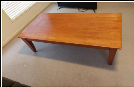
Coffee Table $30.00