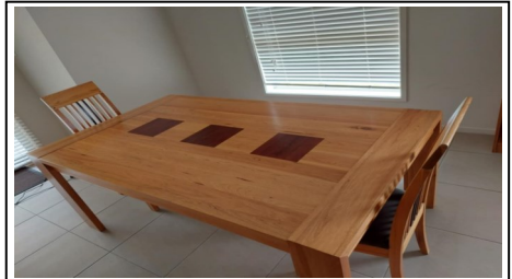
Dining Table with Six Chairs $100.00