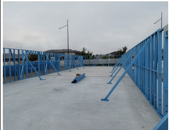
Placing of the frame.