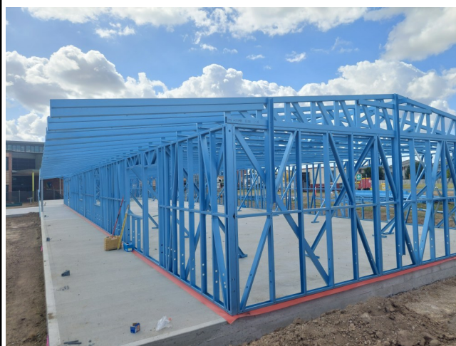
Placing of the roof framing