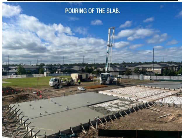
POURING OF THE SLAB.