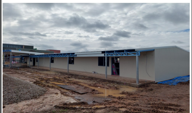
Commencing of Gyprocking of internal walls.